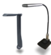
Genee Vision Wireless Visualisers