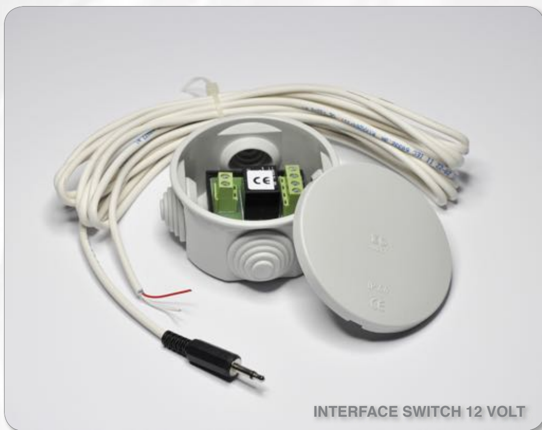
INTERFACE SWITCH 12 VOLT